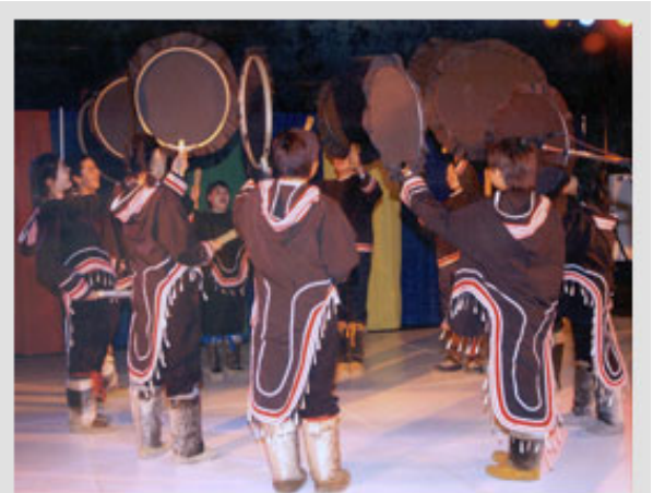
VBNC played a major role in bringing the Nunatsiavut Drum Dancers from Nain, Labrador, to Toronto, Ontario, to participate in the First Night Festival in December 2003.