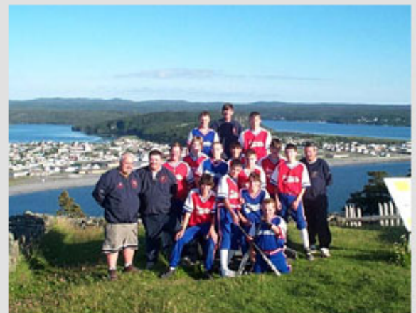
In August VBNC was pleased to sponsor the Eastern Canadian Bantam Boys Fastpitch Softball Championships hosted by the Town of Placentia. VBNC's contribution of $4,000 helped make the tournament a great success. Ten teams participated from Quebec, Ontario, Nova Scotia, New Brunswick, Prince Edward Island and Newfoundland.